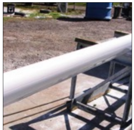
... then NYALIC over-coated