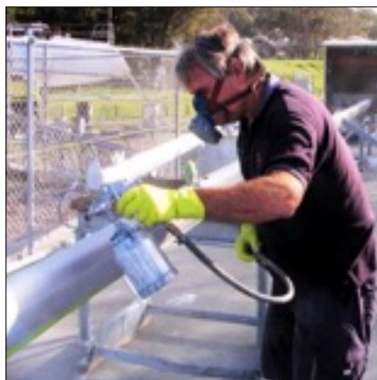
... a good surface preparation